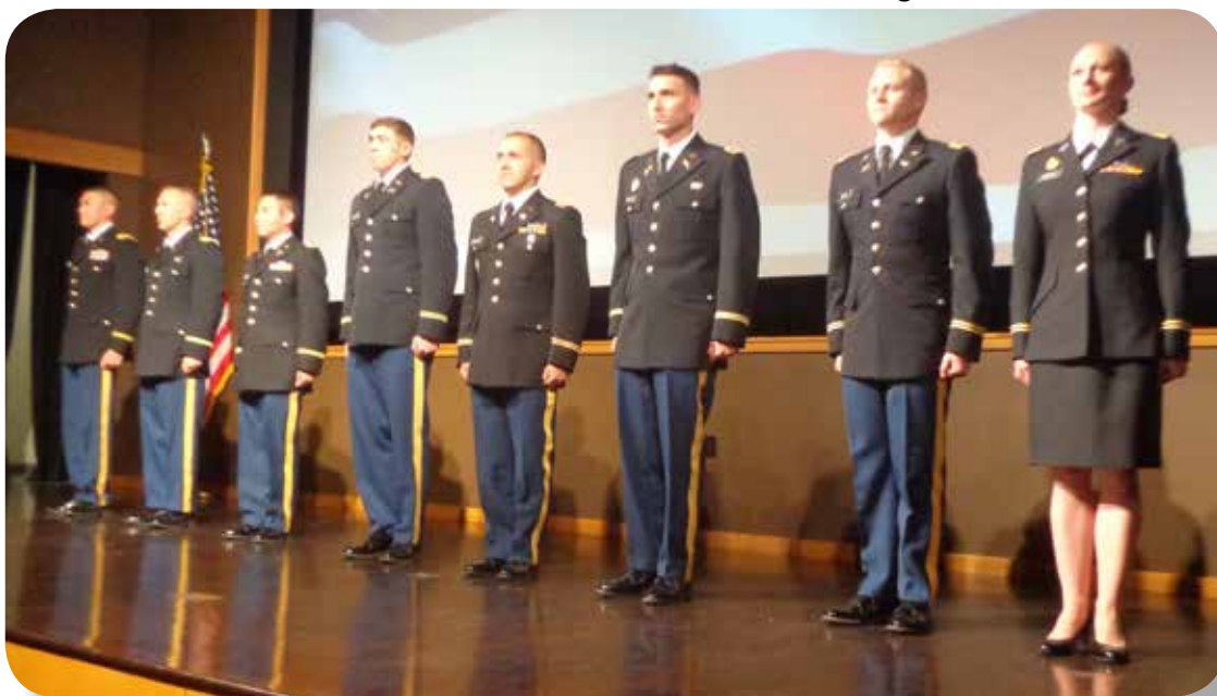
Newly Minted Lieutenants — 13 May UNR ROTC Commissioning